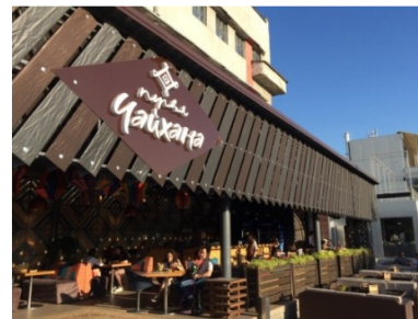
Restaurant "First Chaikhana"