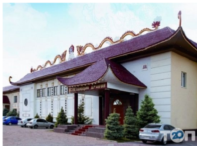
Restaurant «"Rising Dragon"»