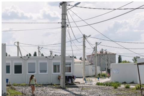
Fig. 1. Modular town of IDPs in Kharkiv

3. Educational international and internal migrants: Kharkiv is called the city of students, because a large number of diverse higher education institutions attract a significant number of students, including from abroad. To meet the needs of students, the following transformations were carried out in the urban space: combining the space of study and living of students in a number of universities in the city; emergence of research and educational spaces; formation of auxiliary institutions and institutions of trade and public catering, entertainment around educational institutions.