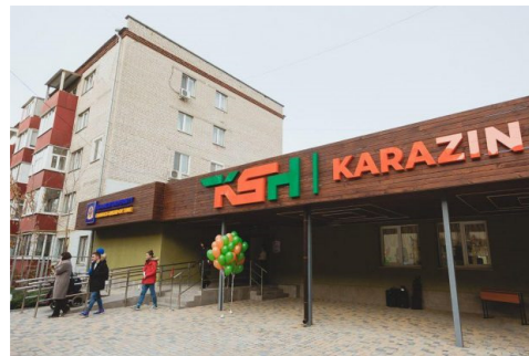
Fig. 2. «Karazin Student Hall»

Students often continue living in Kharkiv after graduation. At the same time, local students easily adapt and eventually change the urban space alongside the city's residents. Most international students return home, but those who stay, due to their excellent culture and traditions, can significantly influence the transformation of urban space, up to the formation of a kind of urban segregation. Thus, traditionally, in Kharkiv, in the area between the metro stations Botanichny Sad and Oleksiivska, a kind of campus has been formed, which has a fragmentation of accommodation of Ukrainian and foreign students. Foreign students often stay in the same areas for permanent residence after graduation. Eventually, commercial, entertainment, or social facilities began to appear for some nationalities.